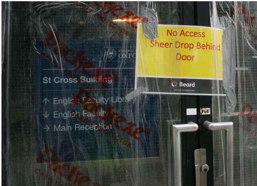
A hint at the scale of the changes happening behind the hoarding

As any recent visitor to the St Cross Building will be aware, we are currently in the middle of a building project, which will improve wheelchair access throughout the building as well as providing a new flexible café area and teaching space. The English Faculty Library will have a new accessible entrance, and the main Faculty entrance will now be next to the Porter's Lodge; the Faculty will particularly benefit from full accessibility throughout the building, new lifts and toilets, and a new, more prominent entrance to the Faculty. Improvements also include an updated Faculty Office and open reception area.